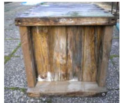
A wood planter box.

In order to improve its durability, the wood should be treated before use. For outdoor use, the current methods of treatment include the addition of chemicals. There are also some problems about fungal growth and mold growth. It is difficult to clean the wood with a simple duster cloth. While the planter Hortense is designed to be contacted with the user, by providing a comfortable support, the wooden tub is not a reasonable choice.